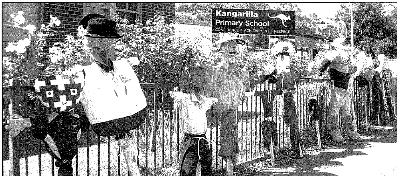
Scarecrows are everywhere at the Kangarilla Primary School.